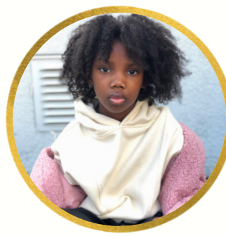
Kurly Kyra YouTube Sensation Influencer