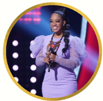
Casmé' Celebrity Vocalist NBC Appearance "The Voice"