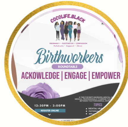
Black Maternal Health Week April Annually