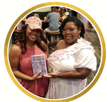
Coco Mom Tour Summer of 2021