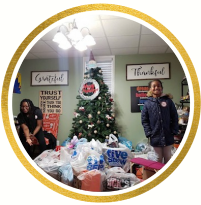
Annual Coat & Toy Drive December 2021