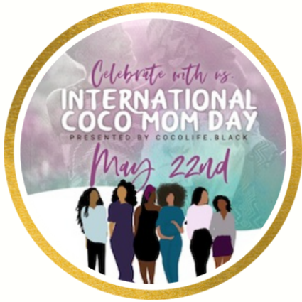
International Coco Mom Day May 22nd Annually