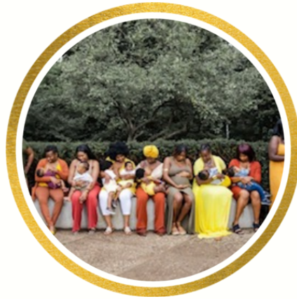
World Breastfeeding Month & Black Breastfeeding Week Annually in August