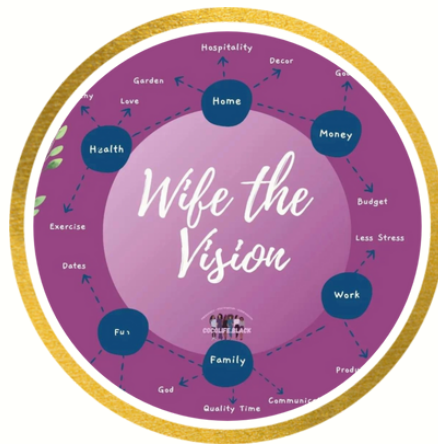
Wife the Vision Workshop Winter 2022