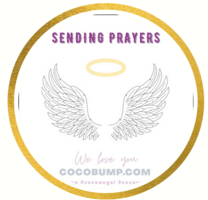
International Day of Compassion for Pregnancy & Infant Awareness October 15th