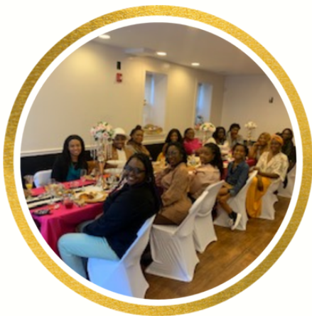
Kusanya Networking Brunch Quarterly