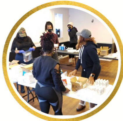
MLK Day of Service 2022